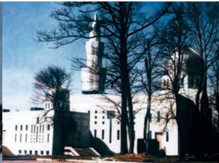
Bait Al-Islam Mosque, Maple, Ontario, Canada. Built in 1992 by Gulzar Haider.

The religious center combines a main prayer hall capped by a stainless steel dome. The architect successfully captures the spirit of medieval Mamluk architecture of Egypt in the new setting of Canada.