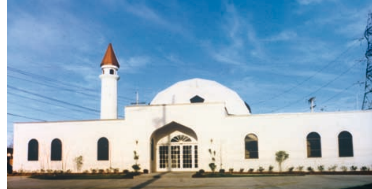
Mosque Abu Bakr Al Siddiq, Metairie, Louisiana. Built 1988 by Al-Dahab

The first large traditional Islamic style structure in the United States was inspired by the Mamluk architecture of Cairo. The design also includes Ottoman Turkish and Andalusian decorative motifs. The interior furnishings are also a multi-ethnic mix. The wall tiles were donated by Turkey, the chandeliers are from Egypt, and the carpets were a gift from the Shah of Iran. Financed by the diplomatic missions of Islamic countries and wealthy Muslim sponsors, the project became a symbol of Muslim unity and identity in the United States. The building is listed in the Historic American Buildings Survey.