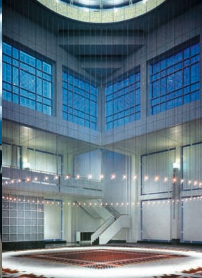
Islamic Cultural Center, New York, New York. Completed in 1991 by Skidmore, Owings & Merrill.

Traditional Ottoman forms, as well as Islamic geometrical icons and calligraphy are expressed effectively in contemporary architectural language.