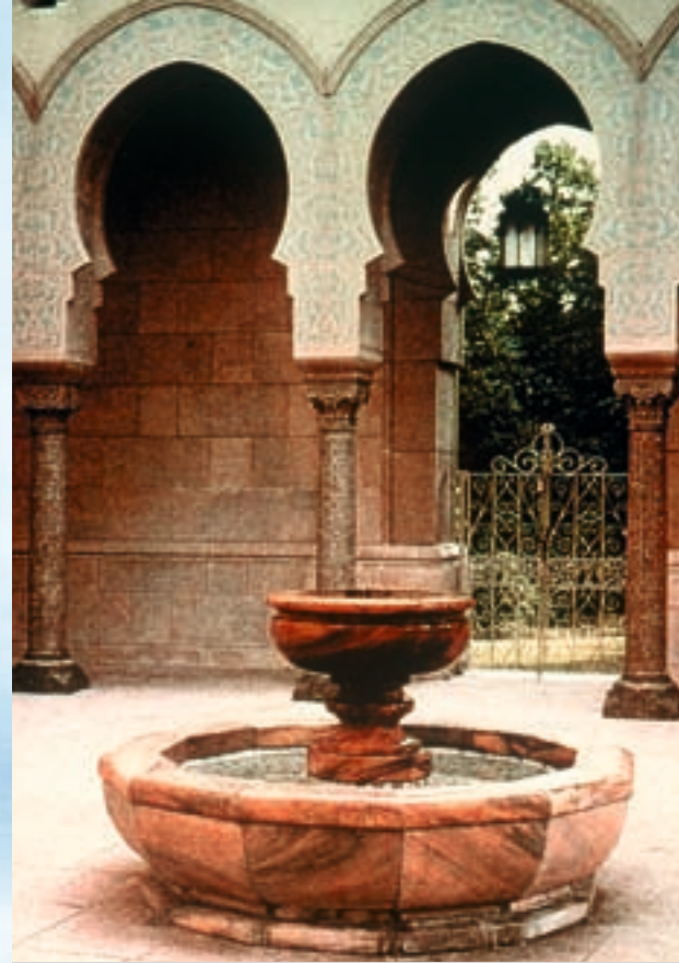
Islamic Center of Washington, Washington, DC. Built in 1950 by Mario Rossi.

The first large traditional Islamic style structure in the United States was inspired by the Mamluk architecture of Cairo. The design also includes Ottoman Turkish and Andalusian decorative motifs. The interior furnishings are also a multi-ethnic mix. The wall tiles were donated by Turkey, the chandeliers are from Egypt, and the carpets were a gift from the Shah of Iran. Financed by the diplomatic missions of Islamic countries and wealthy Muslim sponsors, the project became a symbol of Muslim unity and identity in the United States. The building is listed in the Historic American Buildings Survey.