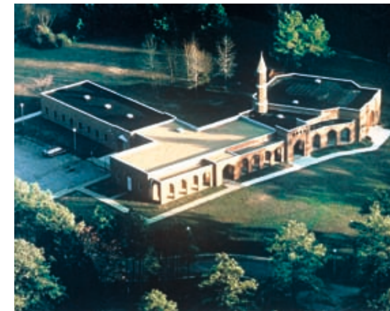
Islamic Center of Virginia, Richmond, Virginia. Built 1990 by Frahar-Favoro.

The religious center combines a main prayer hall capped by a stainless steel dome. The architect successfully captures the spirit of medieval Mamluk architecture of Egypt in the new setting of Canada.